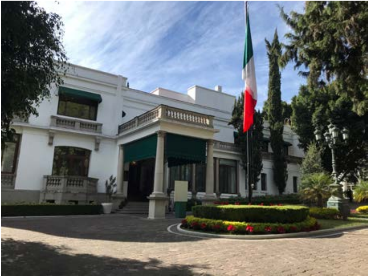
LOS PINOS CULTURAL COMPLEX , former Official Residence of Los Pinos .