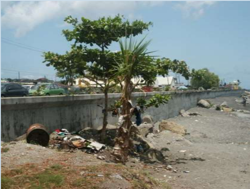
A beach in trouble