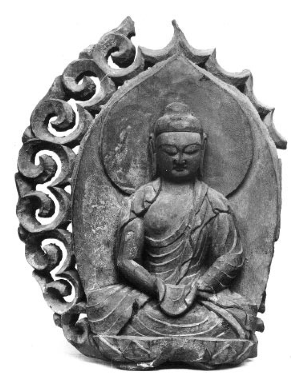
FIG. 1. Kocho. Seated Buddha. Wood.

material remains found in the tombs at Astana and Karakhoja (two cemeteries in the suburbs of Kocho) are Chinese documents, silk fabrics, clay sculptures, wooden figures (Fig. 1), paintings (Fig. 2), pottery and woodwork, building equipment, dried fruit and dried foods, Byzantine gold and Persian silver coins, as well as T'ang copper coins. Although most of these relics are damaged and incomplete, they are authentic products of the T'ang period. In the paintings on silk, for example, the 'plump women' are typical of the peak period of T'ang art. Many of the Confucian classics were found in the tombs around Kocho.