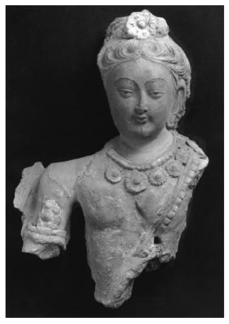
FIG. 4. Kumtura. Bodhisattva. Musée Guimet, Paris.

the large monastery of Miran, and Ming-oi at Karashahr, and monasteries at Kocho and Yar in the Turfan area. More than 1,000 Buddhist caves have been located in presentday Xinjiang region, most of them with painted murals. For example, the walls and ceilings of every cave in the Kyzyl cave-temple have murals illustrating Buddhist legends and representing the finest expression of Graeco-Irano- Gandharan art (Fig. 3). There are also styles typical of T'ang painting in the murals of the Kumtura and Bezeklyk cave-temples. Some temples had clay figures of Buddhas and Bodhisattvas (Fig. 4), but most are badly damaged.