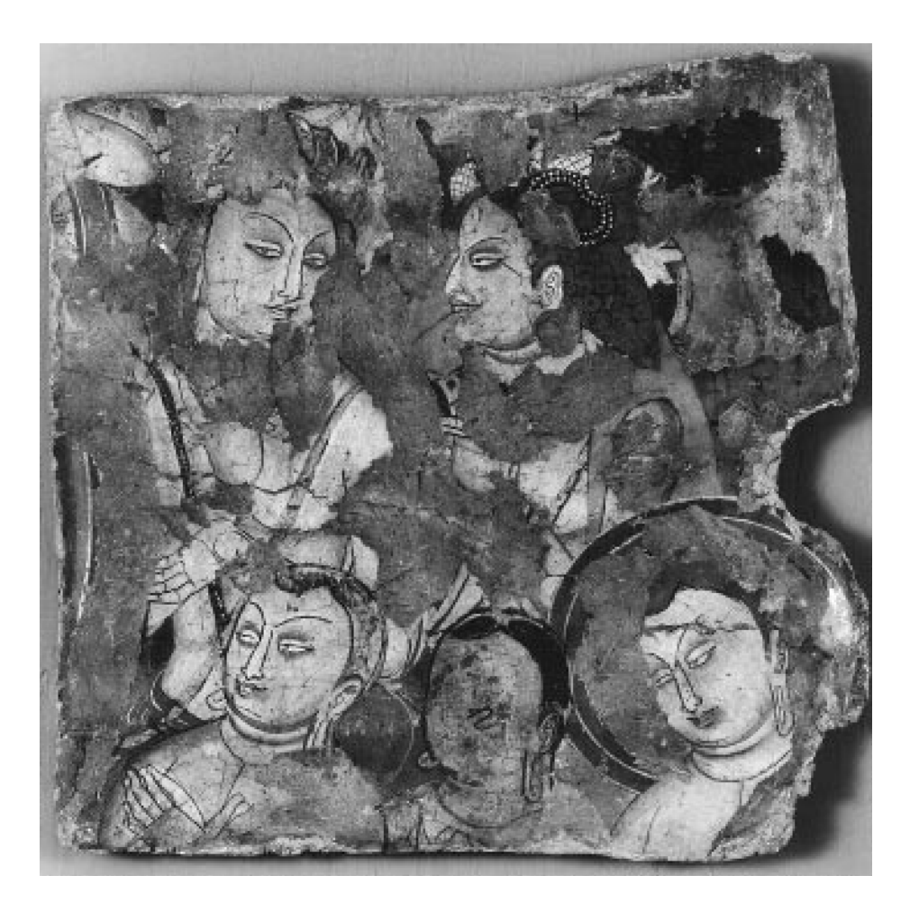
FIG. 3. Kyzyl. Wall painting.

Most Buddhist monasteries and temples in the Western Regions were built along streams in mountain valleys, or in cave-temples. The best-known of these are the Kyzyl in present-day Bay, the Kumtura, the Kyzyl-kargha and Simsim cave-temples in the Kucha area and the Bezeklyk and Toyoq cave-temples in Turfan. In addition, there are large Buddhist temples and stupas built on flat ground, such as the ruins of the Su-bashi monastery in Kucha,