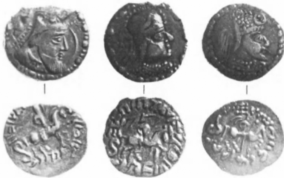
FIG. 6. Chorasmanian coins. (Courtesy of V. M. Masson.)

reverse a royal archer seated (Fig. 7). Early Parthian coins bore inscriptions in Greek which in time became more and more corrupt, and from the first century A.D. local inscriptions in Pahlavi began to appear. Although Margiana may have had its own silver coinage, the fact that it issued its own bronze coins, which have been found in large numbers not only in the ruins of cities but in many rural settlements, is of much greater importance. In the development of day-to-day small-scale trading and commodity-money relationships, Margiana closely resembled Bactria. 38