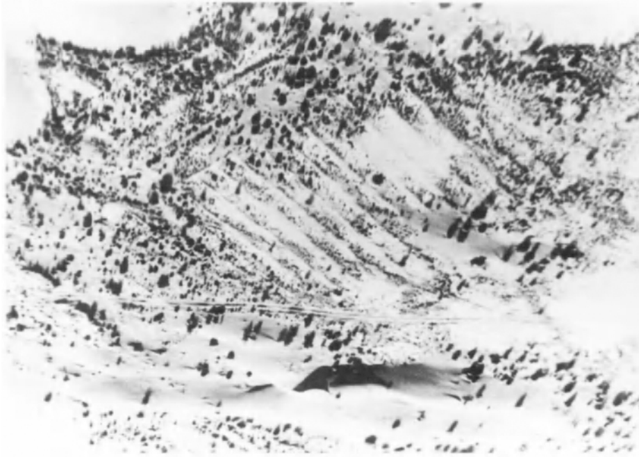
FIG. 3. Traces of an ancient vineyard in Chorasmia.