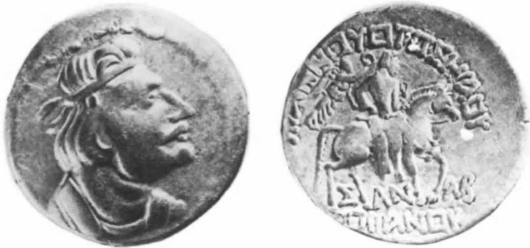
FIG. 4. Tetradrachm of the Kushan 'Heraus'.