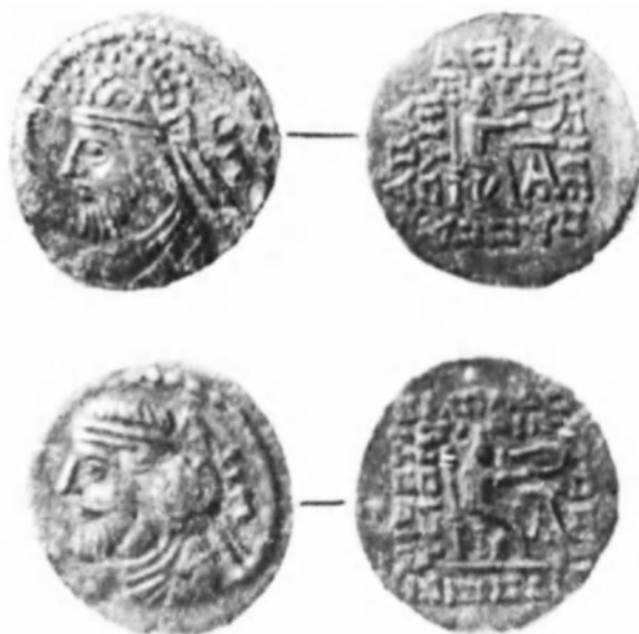
FIG. 7. Coins of Sanabares.

In the Bukhara oasis, silver coins were issued from the second century A.D. They were modelled on the tetradrachm piece of the Graeco-Bactrian king Euthydemus and bore his profile on the obverse and a seated Zeus on the reverse. As was the case elsewhere, the Greek legends became increasingly corrupt and were finally replaced by legends in Sogdian. They did not suffer any significant reduction in weight but the purity of their silver was considerably debased.