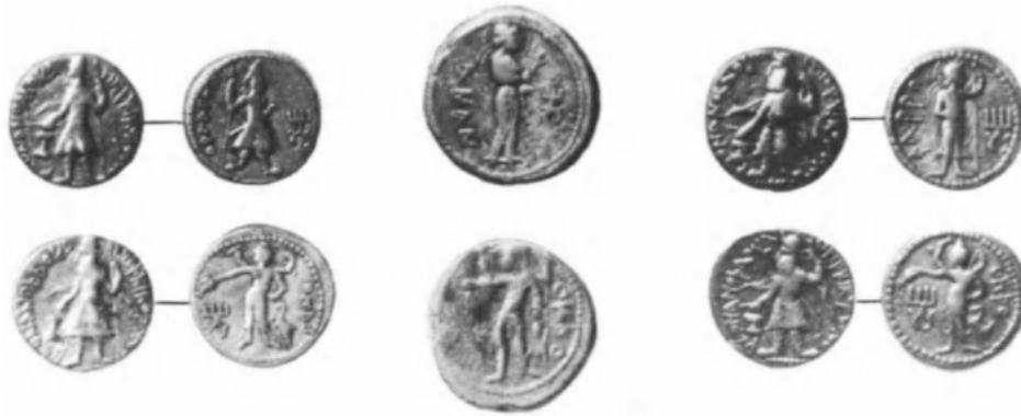
FIG. 5. Coins of Kanishka.

Unlike silver and gold coins, Kushan copper money did not generally circulate outside the territory of the Kushan state, and the area in which copper-coin finds have been recorded provides a clear indication of the line followed by the northern frontiers of the Kushan Empire. Copper coins have been found not only in south Tajikistan and south Uzbekistan, but also along the Amu Darya as far as Chorasmia. However, almost all the coins found in Chorasmia itself had been countermarked, and in the opinion of modern historians, this indicates that Chorasmia was not part of the Kushan state. 36