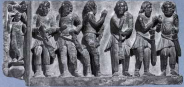
▲ A group of Parthian warriors carved in stone relief. Note their trousers, which show that they were horsemen.

Relationships between the Chinese and the Kushans were relatively good, but the Romans and Parthians were not on such friendly terms. Rome resented paying huge prices for goods that had passed through Parthian lands and, in an attempt to bypass the middlemen, looked more to the sea routes from the Red Sea to India as a means of obtaining eastern goods. But so long as these four empires remained stable and able to protect the trade routes, overland trade flourished.