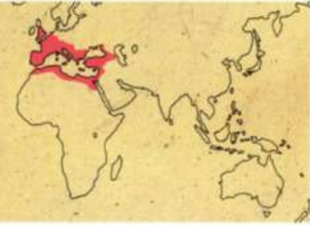
▲ The red area on this map shows the extent of the Roman Empire around 100 CE.

While the Han Dynasty prospered in the East, the Roman Empire continued to grow in the West. By the beginning of the Common Era, the Roman Empire stretched from northern France to the shores of North Africa, and from Spain in the west to the eastern shores of the Mediterranean. This guaranteed protection for trading caravans at the western end of the Silk Road.