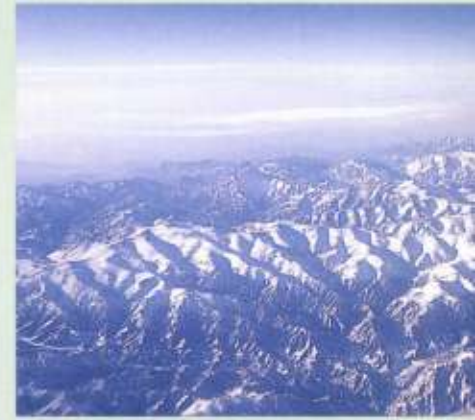
▲ The Tian Shan or 'Heavenly' Mountains. Zhang Qian had to cross the western end of this high range to reach Ferghana.

Zhang Qian was not the first to travel across the mountains to the West. This route had almost certainly been used by occasional traders for several centuries. But it was through Zhang Qian that China discovered the potential for trade with the West, thus laying the foundations for what was eventually to be known as the Silk Route.