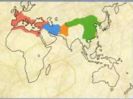
▲ Map of the four empires crossed by the Silk Route around 100 CE: the Roman (red area), the Parthian (blue area), the Kushan (orange area) and the Chinese (green area).