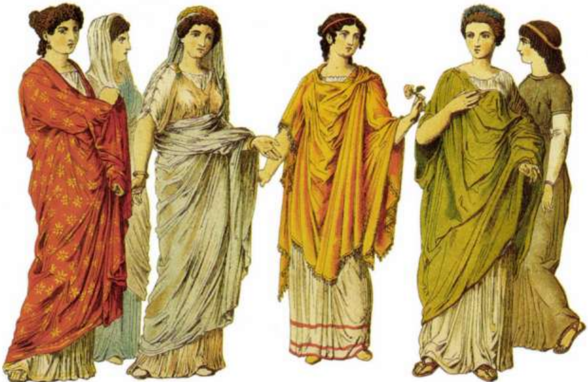
▼ Roman women would have worn clothes like these, some of them made from highly-fashionable silk.

As capital of this empire, Rome became a city of great wealth and sophistication importing products from far and wide. When Chinese silk first reached Rome it caused a sensation. The Romans had never before seen such fine material, and silk garments became the height of fashion amongst the aristocracy. In no time silk was in great demand, and its popularity began to spread throughout the Roman Empire. The Romans could not get enough silk to satisfy the demand, and silk began to fetch huge prices. It was literally worth its weight in gold!