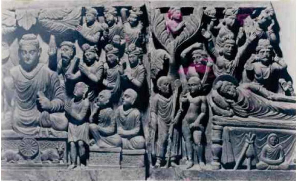
Sections of a frieze from Gandhara 2^{nd} century A.D.