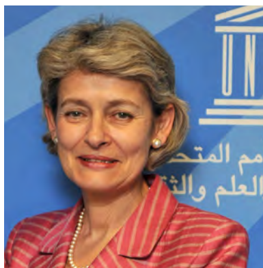
by Irina Bokova , Director-General of UNESCO

UNESCO is the United Nations agency mandated to promote physical education and sport through concerted, collaborative and participatory action to support the rounded development of every individual.